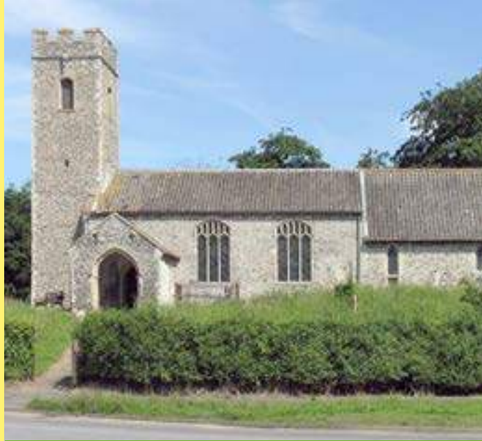
ATTLEBRIDGE WITH ALDERFORD