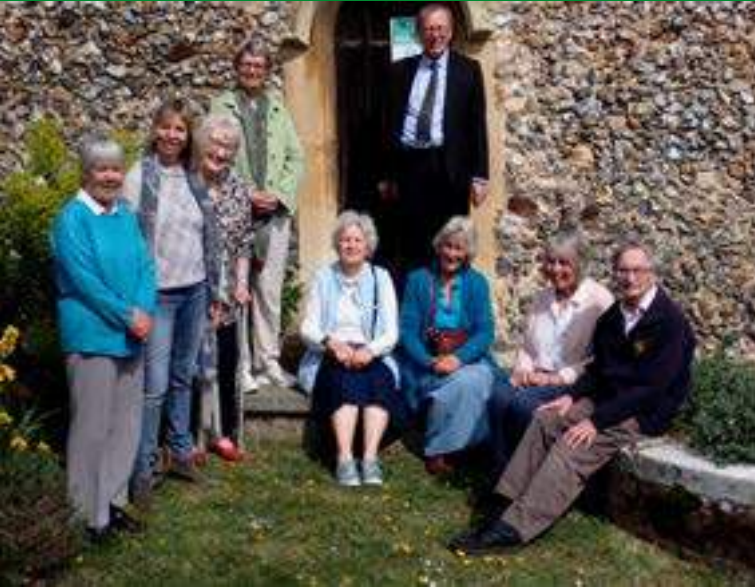
St Mary's St Michael's