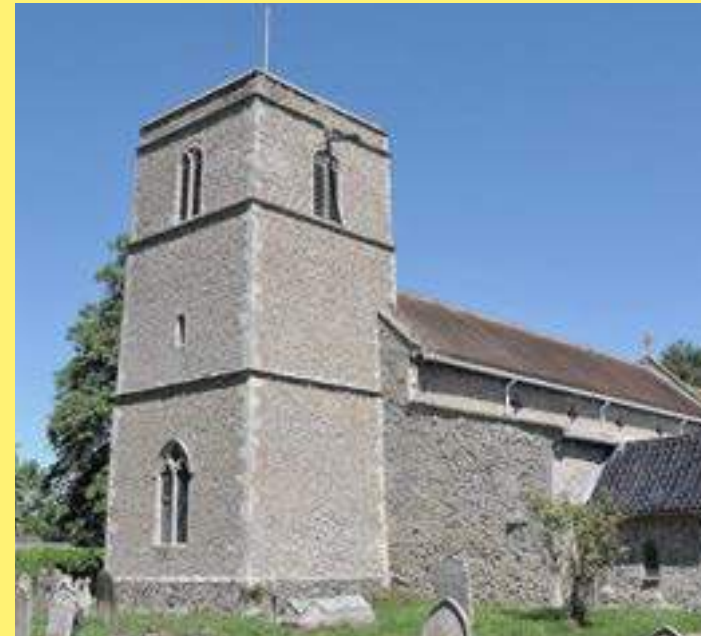
WESTON LONGVILLE WITH MORTON-ON-THE-HILL